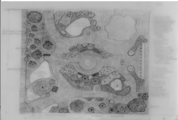
Alumni Memorial Garden